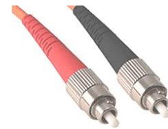
~ Fiber cables not included ~