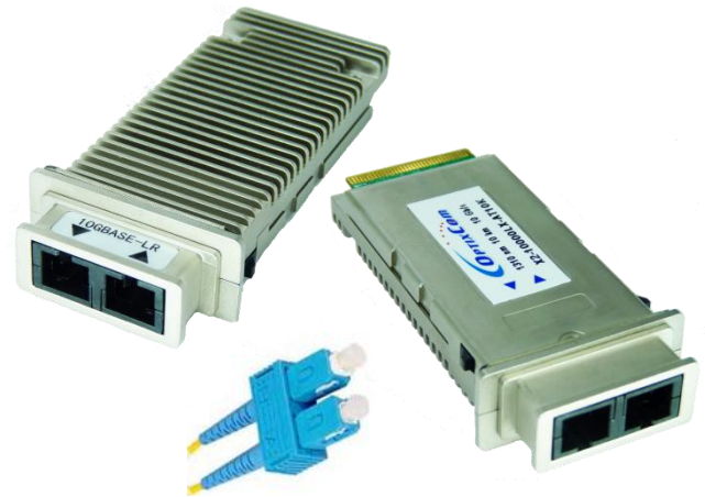
10 Gb/s, 2 31 -1 NRZ data eye pattern