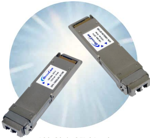
100 Gb/s CFP4 Package