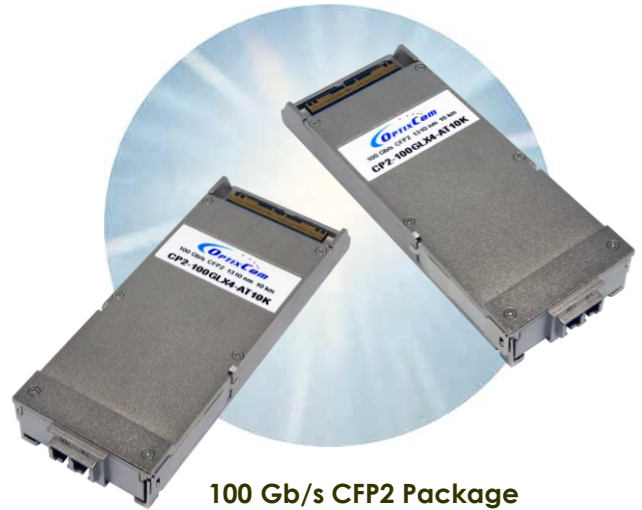
100 Gb/s CFP2 Package